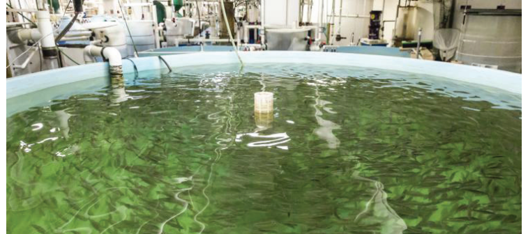
Tank with fish